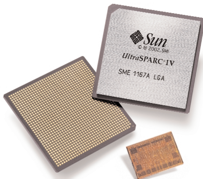
UltraSPARC IV Processor

The UltraSPARC IV processor is binary compatible with previous generations of SPARC processors and will support both versions 8 and 9 of the Solaris Operating Environment. This is consistent with Sun's commitment to protecting customers' investments in software and training. The UltraSPARC IV processor can also provide an upgrade path for servers powered by the existing UltraSPARC III processor.